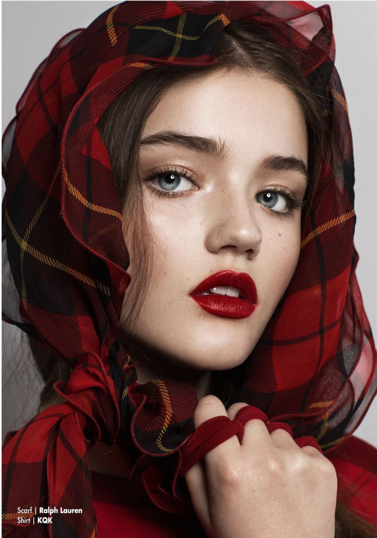
Scarf | Ralph Lauren Shirt | KQK