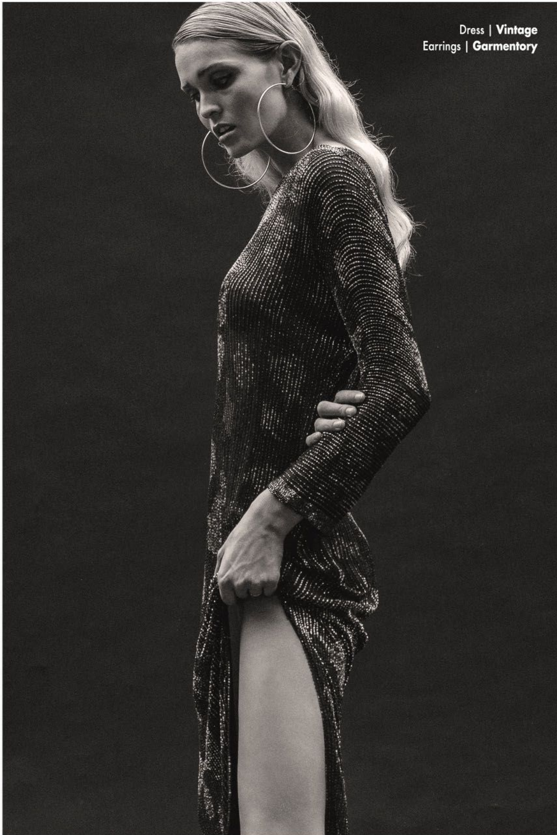
Dress | Vintage Earrings | Garmentory