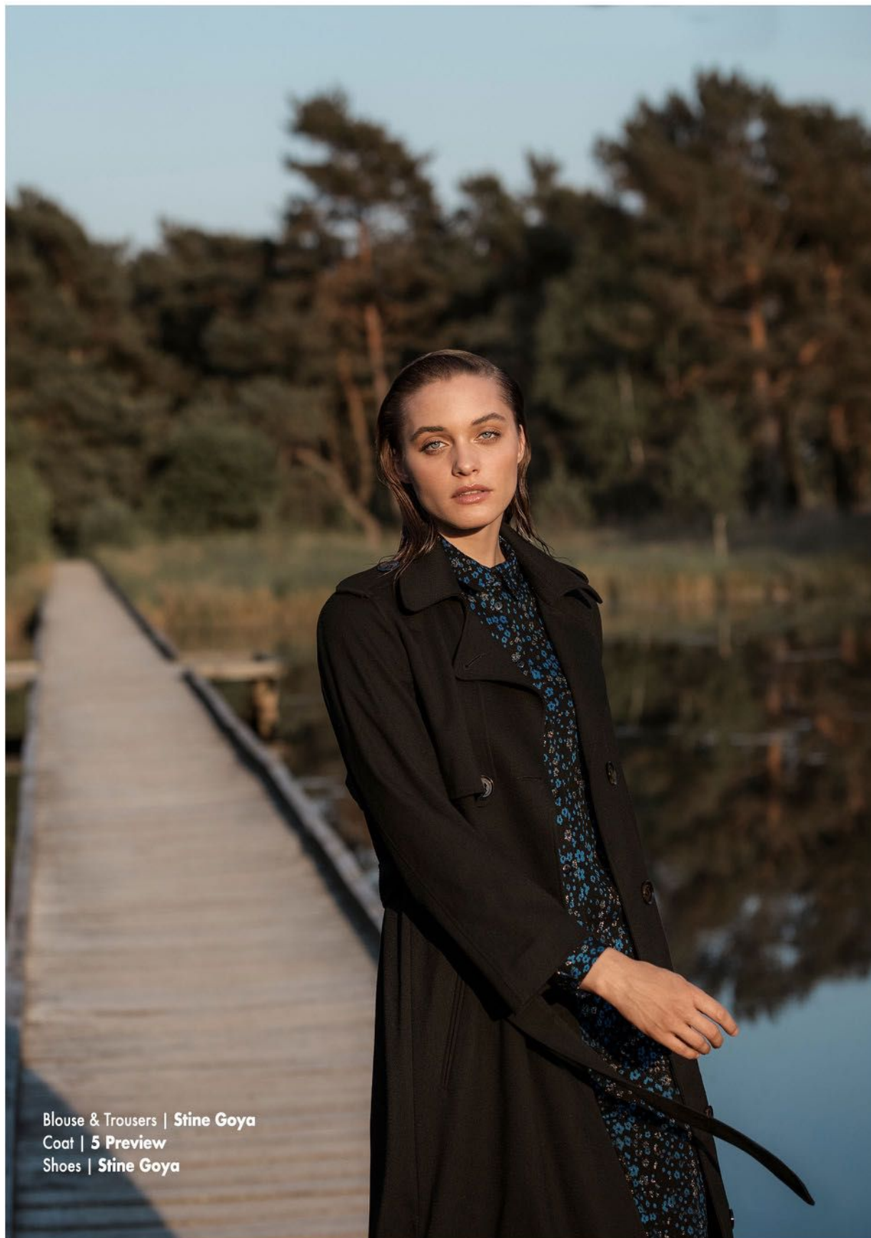
Blouse & Trousers | Stine Goya Coat | 5 Preview Shoes | Stine Goya