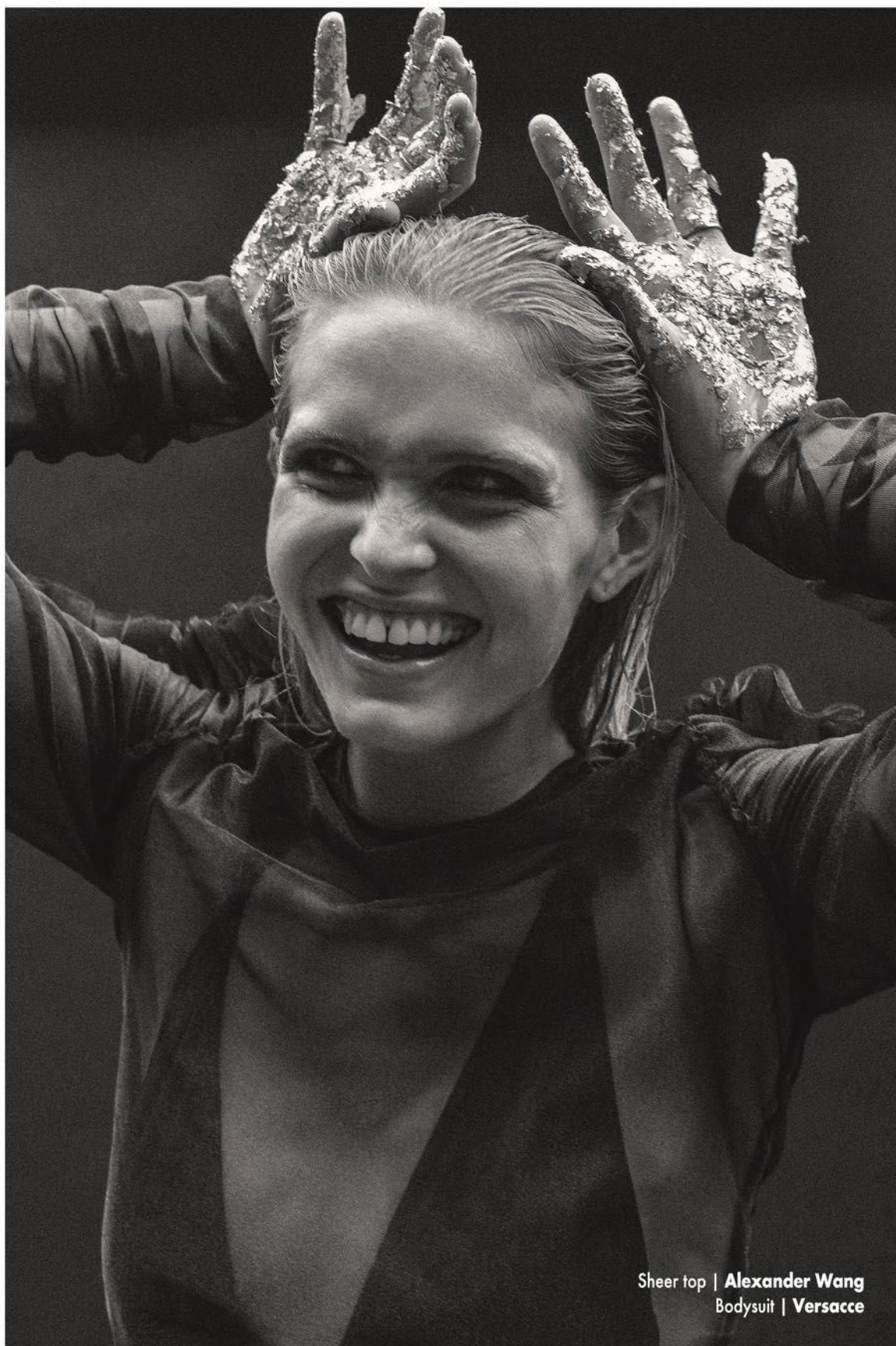
Sheer top | Alexander Wang Bodysuit | Versace