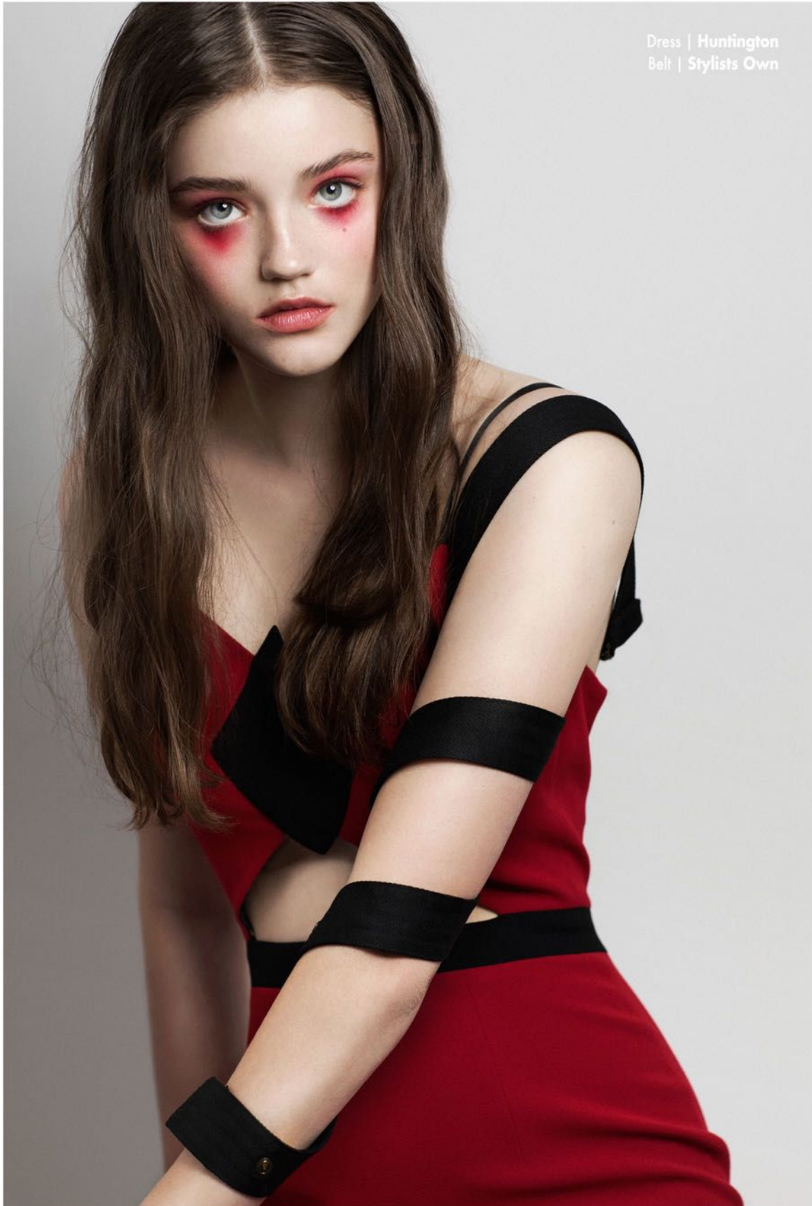
Dress | Huntington Belt | Stylists Own