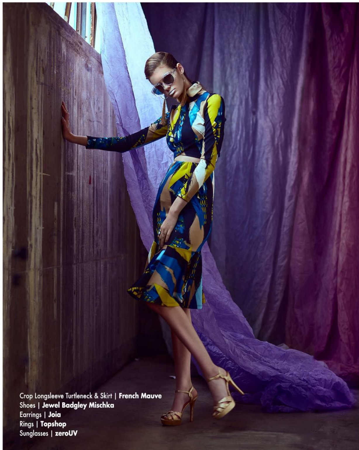
Crop Longsleeve Turtleneck & Skirt | French Mauve Shoes | Jewel Badgley Mischka Earrings | Joia Rings | Topshop Sunglasses | zeroUV