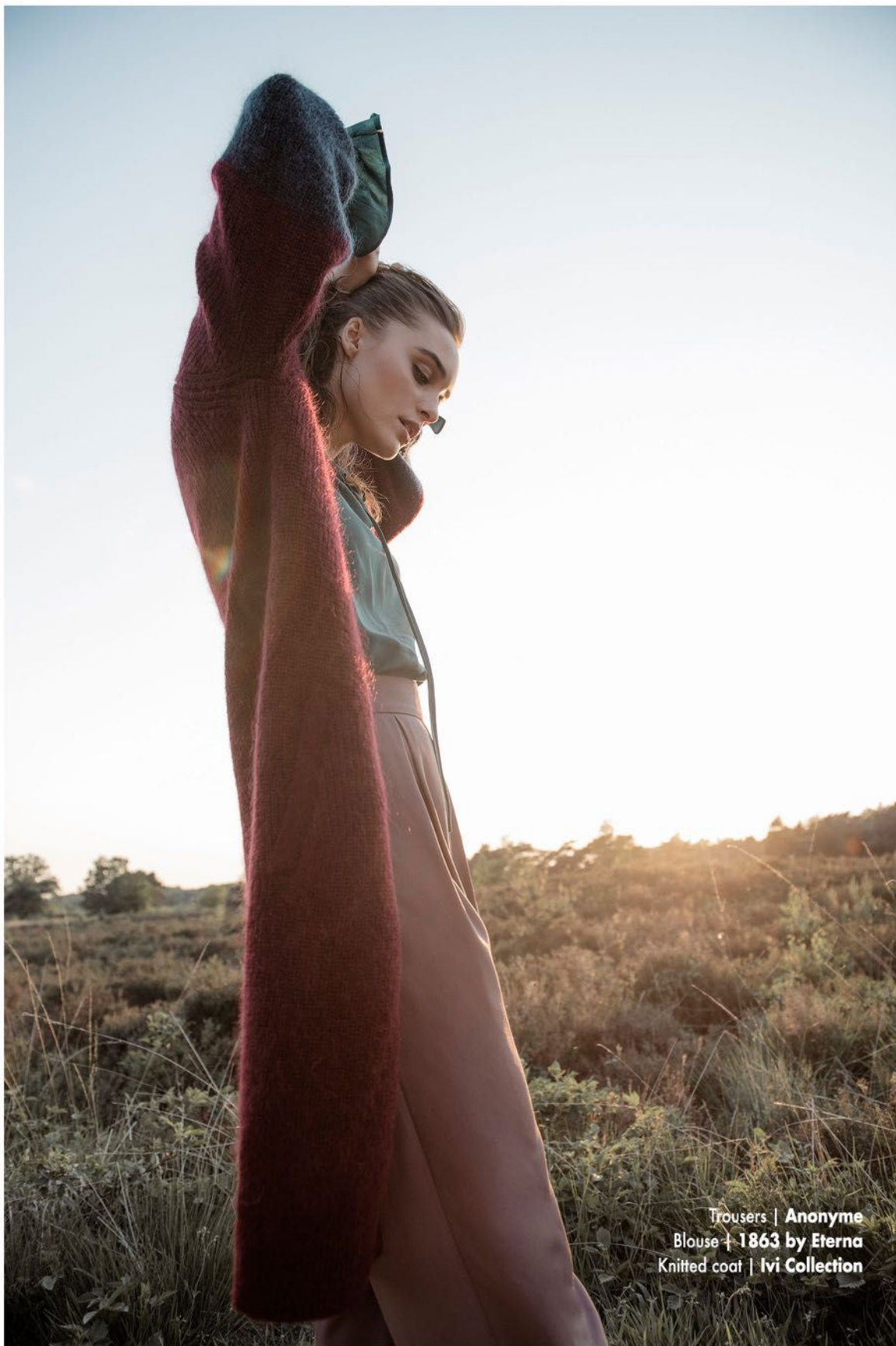
Trousers | Anonyme Blouse | 1863 by Eterna Knitted coat | Ivi Collection