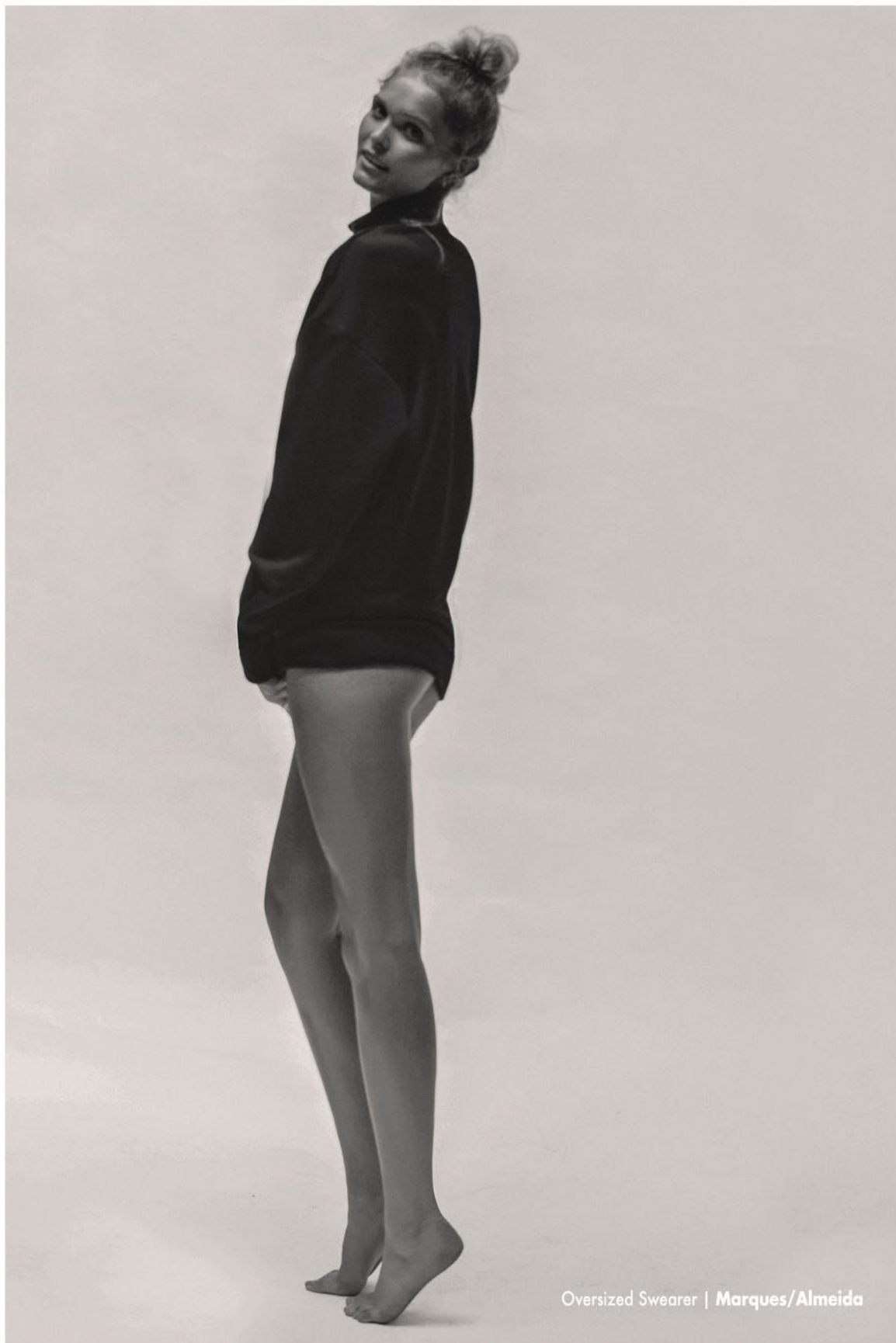
Oversized Sweater | Marques/Almeida